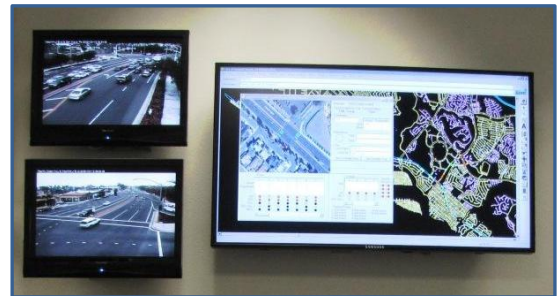
City Hall Traffic Management Center

This year, we will complete the $6 million traffic signal synchronization program that has measurably improved mobility within all areas of our city. Today, we guide traffic through our intersections with real-time adjustments via closed circuit cameras. Yes, there are people back at City Hall who help shorten your commute as it happens.