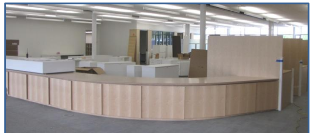
Future One-Stop Permit Center

In 2010, our development services were routinely cited as being the worst in terms of customer service. Today, they have been reorganized under new leadership and have won the “Turning Red Tape into Red Carpet” award from the Orange County Business Council. The new City Hall will add further improvements with a One-Stop Permit Center that has all the permit assistance you need in one place.