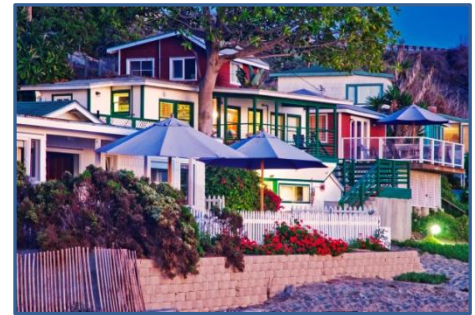
Crystal Cove Cottages

We are blessed to have several resources in our city that are managed by the state or county. The Muth Interpretive Center, Back Bay Science Center, Crystal Cove State Park, are but a few examples. This year, I want us to more fully integrate these magnificent assets into our civic experience. These resources are too important to be ignored simply because some other agency owns or runs them.