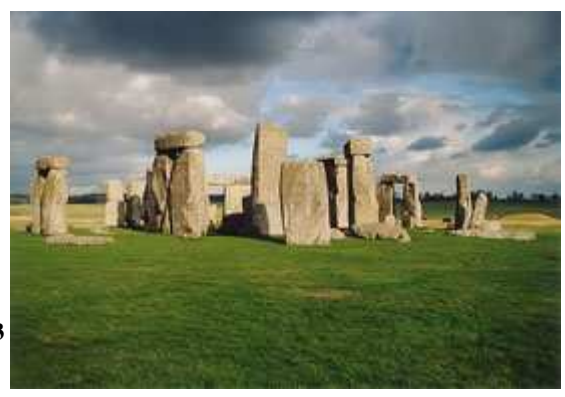
Page 26 of 43

Needless to say, you should always pay due attention to your British hosts (we will invite Britons to take part in our activities); it would not be courteous simply to chat among yourselves and not to mix with the British people who have (in part) invited you to a tour, reception, dinner, etc.