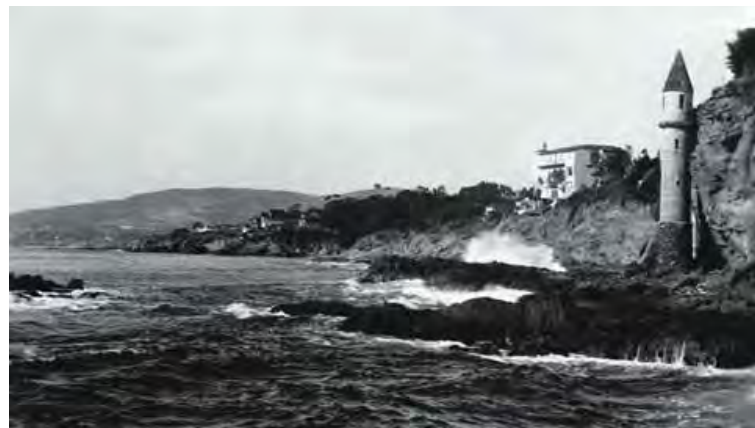
The iconic tower at Victoria Beach in the 1900s