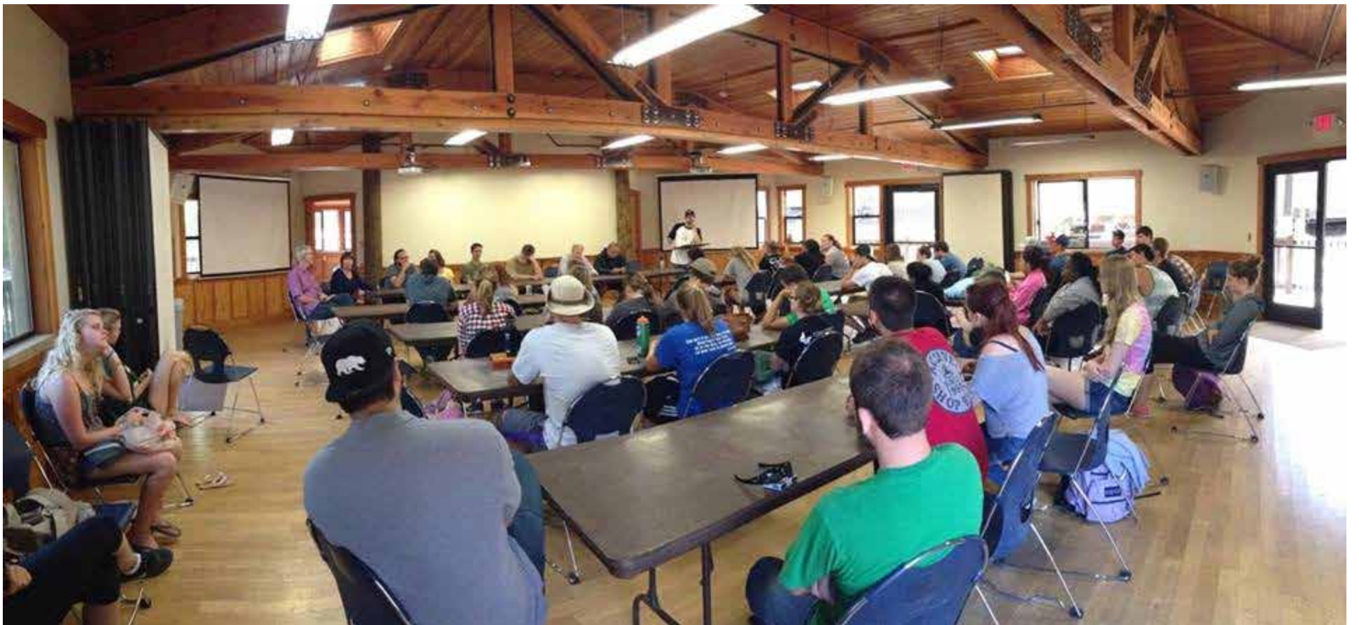
Students and professors engaging during a lecture on Catalina Island

This retreat was a success and allowed students to get a better understanding of themselves and others around them. Every year, CUI Bono has a positive influence and has something for all students to become involved in. The topics are not isolated to one viewpoint, and everyone is encouraged to participate. In addition to this fall retreat, CUI Bono also hosts a monthly lecture series. For more information, visit the First Year Experience tab at cui.edu.