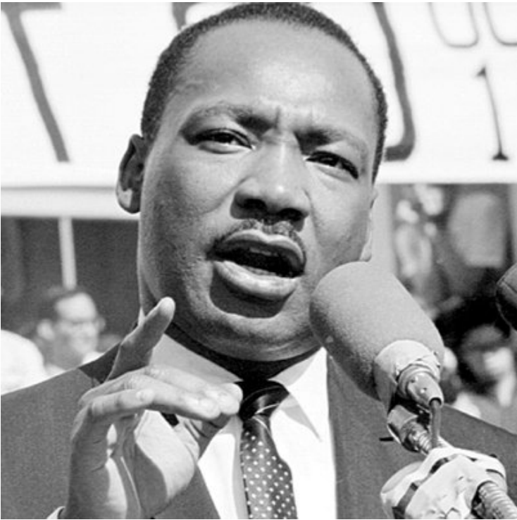
PICTURED BELOW: MLK delivering one of his many powerful speeches.

"Nonviolence is a powerful and just weapon"