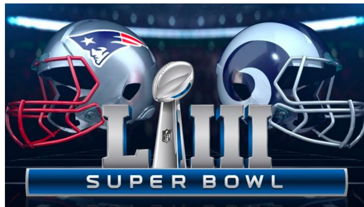
PICTURED ABOVE : Rams vs. Patriots in the Super Bowl taking place on Feb. 3 on CBS.

On Sunday viewers will see if Brady is the GOAT on the field.