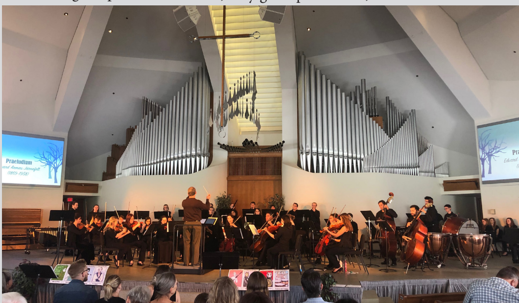
PICTURE LEFT: Concordia Sinfonietta performing in the CU Center