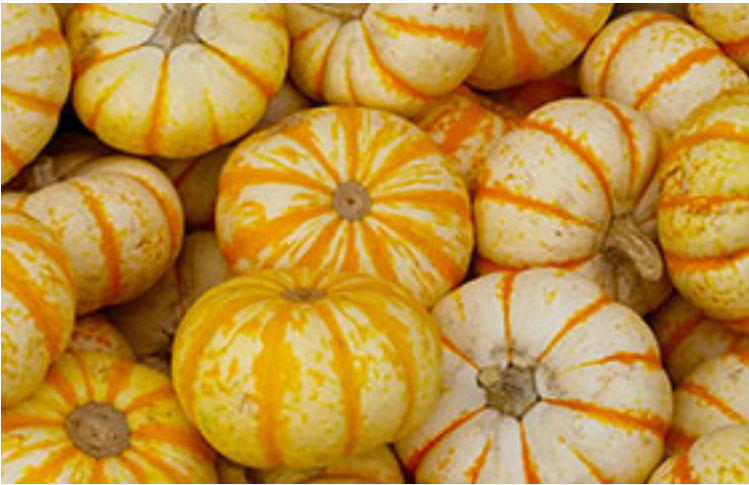
PICTURED ABOVE: The Johnson Brothers Pumpkin Patch is open throughout October.

With Halloween right around the corner, what better way to start your celebration than by taking a friend or loved one to a pumpkin patch. The annual Johnson Brothers Pumpkin Patch is being held this year from October 1 to October 31 on the corner of Jeffrey and Irvine Center Drive. Since the organization began in 1989, the Johnson Brothers have been striving to maintain and improve their pumpkin patch which is located next to Irvine Valley College. They pride themselves on having "thousands of pumpkins to choose from, in all shapes and sizes." The festival is open from 9 a.m. to 9 p.m. and includes free admission and parking to all who attend. There are many rides and activities that the event has to offer which keep kids entertained. Some of the many activities include hunting for the perfect pumpkin, climbing up the hayloft and exploring your way through Indian Village. There is a ticket booth located on site that sells ride tickets for $1.50 per ride. There are also larger packages available to accompany multiple people at