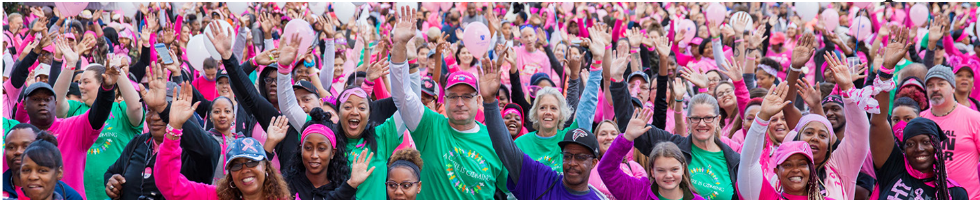
PICTURED ABOVE: Orange County brings awareness to breast cancer throughout the month of October.