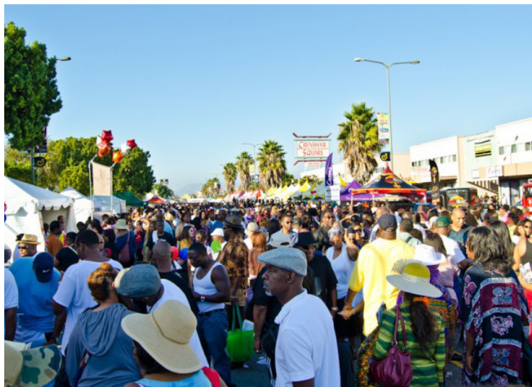
PICTURED ABOVE: A street view of the Taste of Soul.