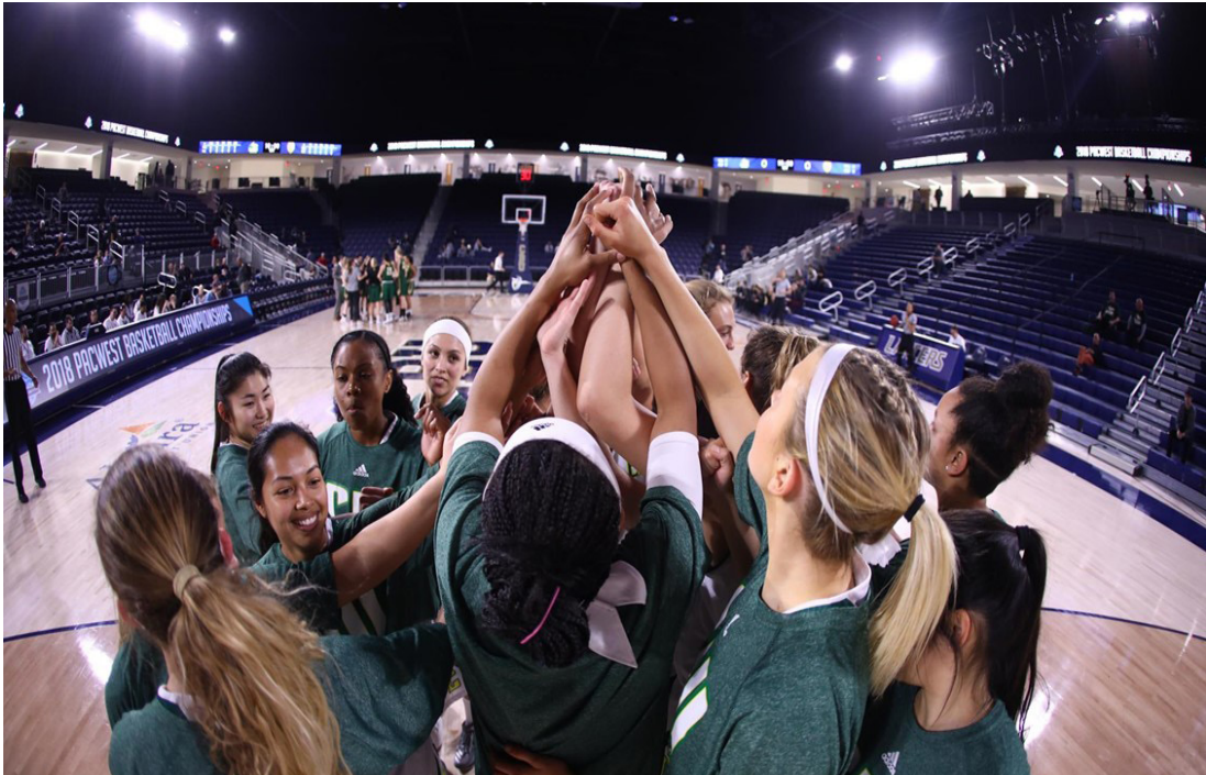
PICTURED ABOVE: Last season’s women’s basketball team gathers together before a game.