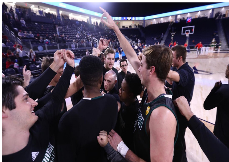
PICTURED ABOVE: Men's Basketball Team at Concordia Seward Nebraska.