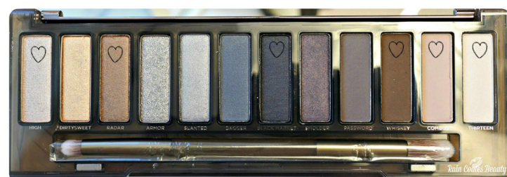
PICTURED ABOVE: Jeffree Star's youtube channel showcases his love and knowledge for cosmetics.