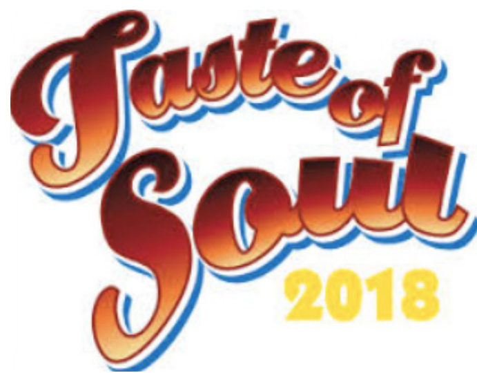
PICTURED ABOVE Dubbed Los Angeles' largest street festival, the 13th annual Taste of Soul hits Crenshaw Blvd. Sat. Oct. 20th from 10 am to 7 pm.

Students may also sign up the morning of the event as long as there are seats available. The bus will be departing from the Grimm parking lot at 9 a.m.