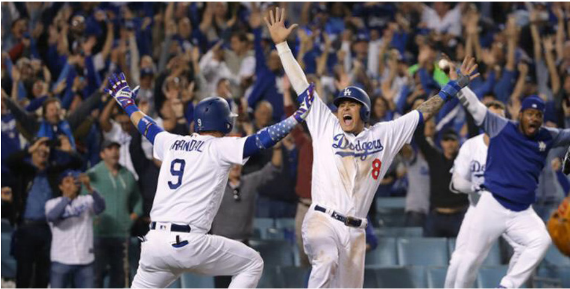
PICTURED ABOVE: The Dodgers celebrate the ending of NLCS Game 4