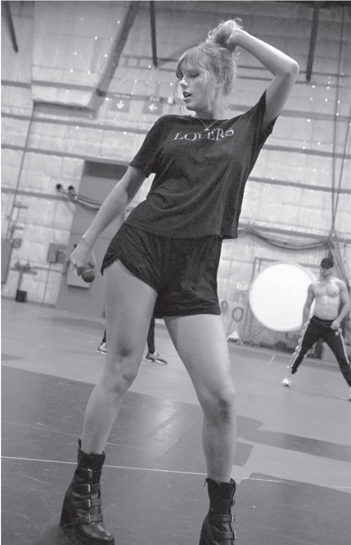
Taylor rehearsing for tour.

Pasadena on May 18 & 19, so get your tickets now!