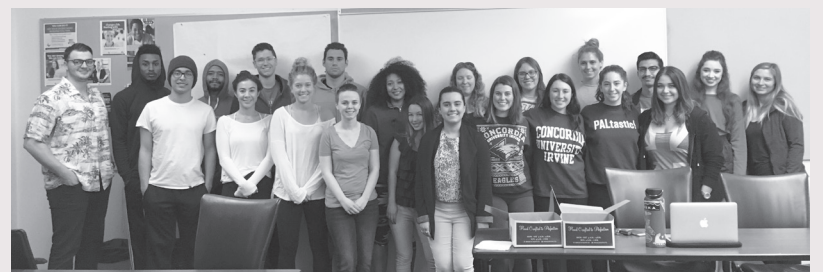
Good luck on finals and congratulations to graduating seniors. The spring staff editors and writers of The Concordia Courier.