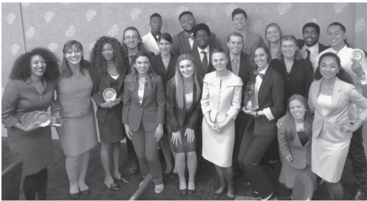
Forensics Speech Team after awards AFA-NIET 2018

Students competed in several platform and oral interpretation events to