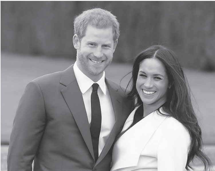
Prince Harry & Meghan Markle.

in Los Angeles with her African-American mother and Caucasian father. She is known for her role in the hit television series “Suits.” Due to the controversy of her engagement to Prince Harry, she has had to deal with a numerous amount of hate and backlash. The backlash has been so horrendous that Prince Harry issued a statement to the public back in Nov. 2016 when they were still newly dating. “Prince Harry is worried about Ms. Markle’s safety and is deeply disappointed that he has not been able to protect her,” the statement said. These threats and backlash just show her decision to marry a prince is going to change her life forever and throw a few challenges her way. Prince Harry is the youngest son of Prince Charles and Princess Diana.