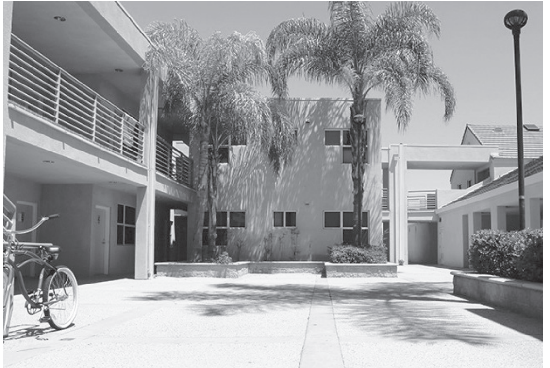
Dorms at Concordia University Irvine.

Concordia is filled with doers and achievers. We are praying for all of you as we head into finals week and summer. We pray that God will bless you and continually show His love for each one of you. We are all so blessed to have been able to serve you as your ASCUI Executive Board!