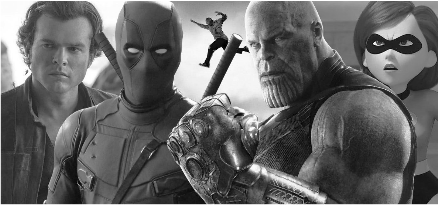
Left to right: Solo: A Star Wars Story, Deadpool 2, Skyscraper, Avengers: Infinity War, and Incredibles 2

anticipated family film this summer is “The Incredibles 2,” the sequel to Disney and Pixar’s 2003 film, “The Incredibles.” Thirteen years in the making, this new film picks up where the last film left us. Only this time, instead of watching Bob go on secret adventures, we follow Elastigirl’s rise to fame. Meanwhile, Bob and the kids spend their screen-time trying to live a normal life. A few original films, featuring several big Hollywood names, also break into the year’s summer lineup. Comedian Melissa McCarthy will star in “Life of the Party,” which follows a single mom who goes back to college with her daughter. The documentary “Won’t You Be My Neighbor,” based on the life of Fred Rogers, the man behind the television show “Mr. Rogers Neighborhood,” is another original premiering June 8. Finally, this summer promises a long overdue “Slender Man” film, based on the legends inspired by the memes surrounding the mysterious specter known as Slender Man. For a complete list of this summer’s upcoming films, visit https://www.imdb.com/list/ls062668868/ .