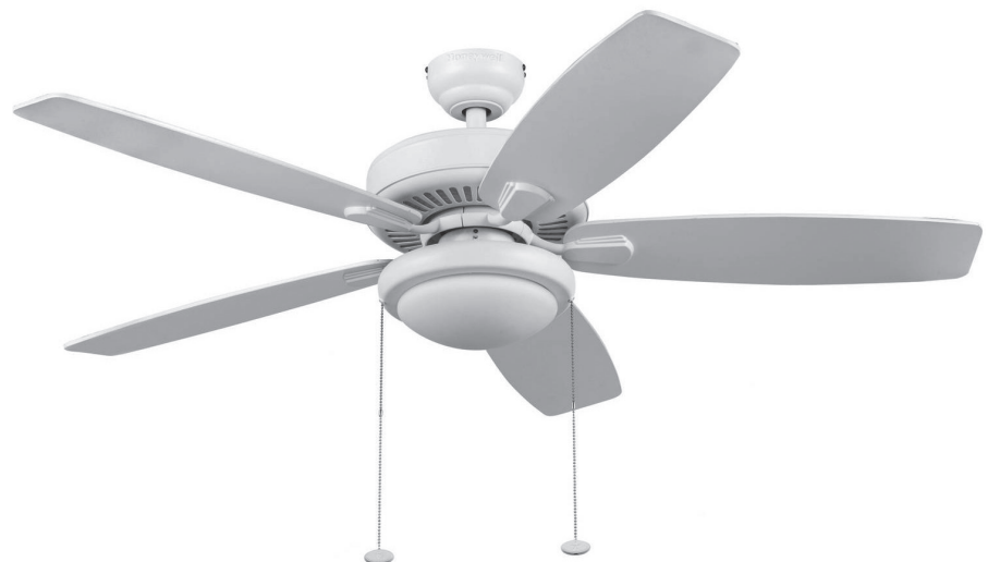
Example of what the fans could look like.