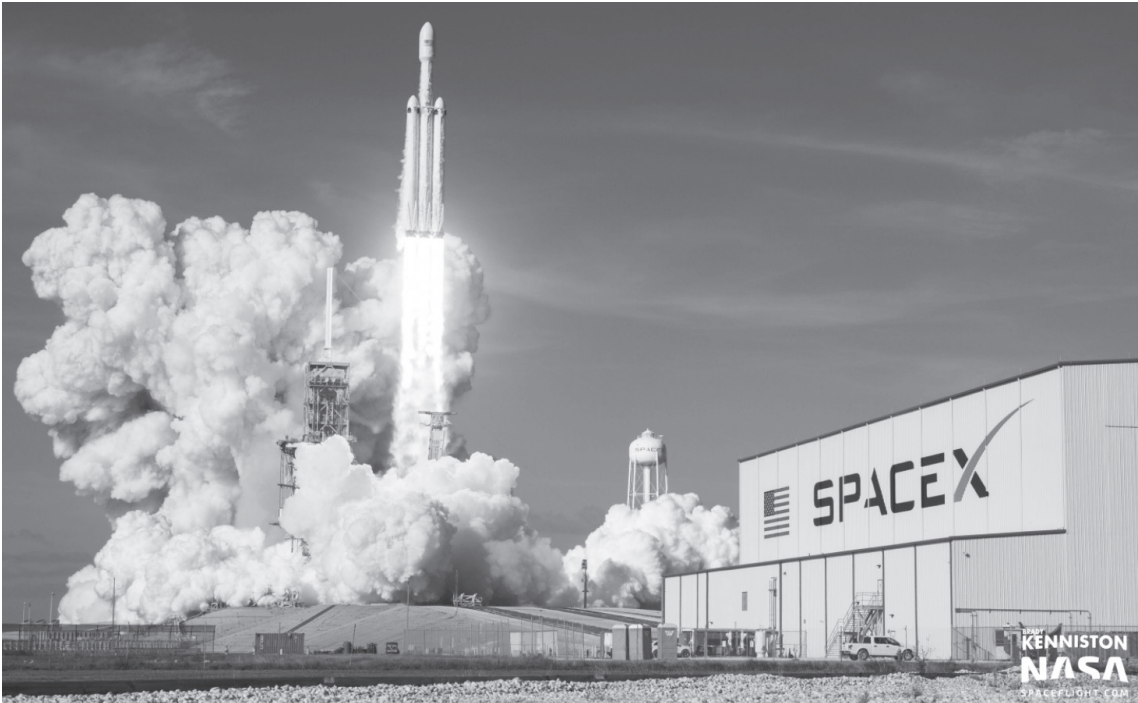
Falcon Heavy rocket launch

launch of the Falcon Heavy rocket was to display to the world the capabilities that human beings are on the verge of attaining. With an incredibly innovative CEO like Musk spearheading these projects, there is no reason to doubt that human beings could likely travel into space commercially via spacecraft within the next five to ten years. As crazy as that sounds, the evidence provided by Musk through his inventions are difficult to argue against. To learn more about the Falcon Heavy rocket and other projects in the making, visit www.spacex.com .