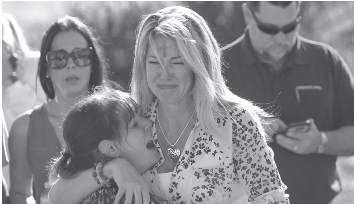
Parents nervously awaiting news about their children following the Marjory Stoneman Douglas High shooting