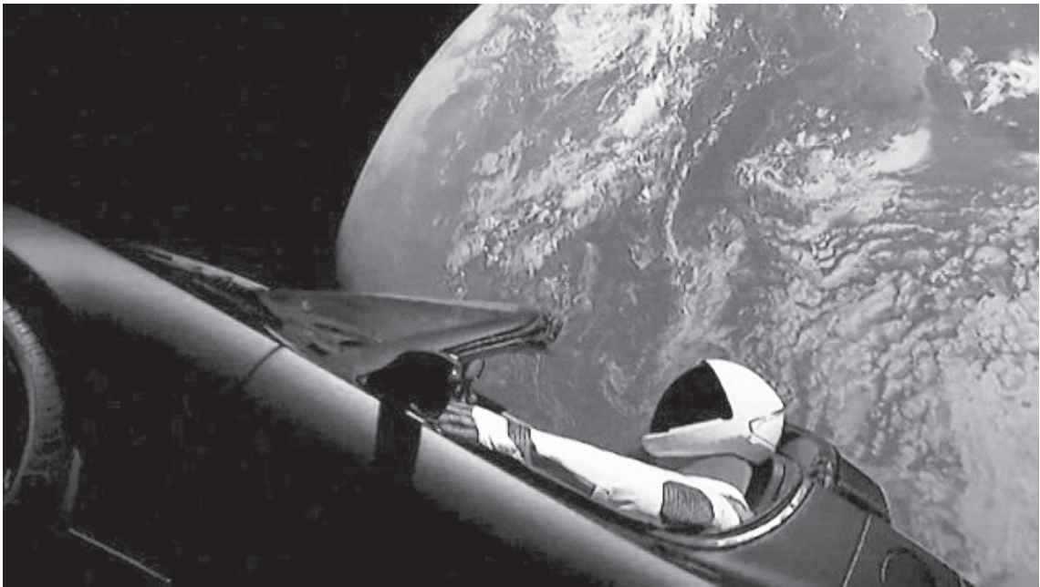
Elon Musk's Tesla orbits in space after rocket launch, Courtesy of metro.co.uk

more than five million pounds of thrust power at liftoff. For perspective, this would be the equivalent of 18 747 aircrafts lifting off simultaneously. Another extremely impressive feat of this massive aircraft is its extensive capacity for cargo on board. SpaceX.com states that the Falcon Heavy is able to lift approximately 140,000 pounds of matter into orbit. This would be greater than the amount of a 737-jetliner full with crew, passengers and luggage. Nick Chang, a graduate student at USD and space research enthusiast, was extremely excited about the launch. “What is may-