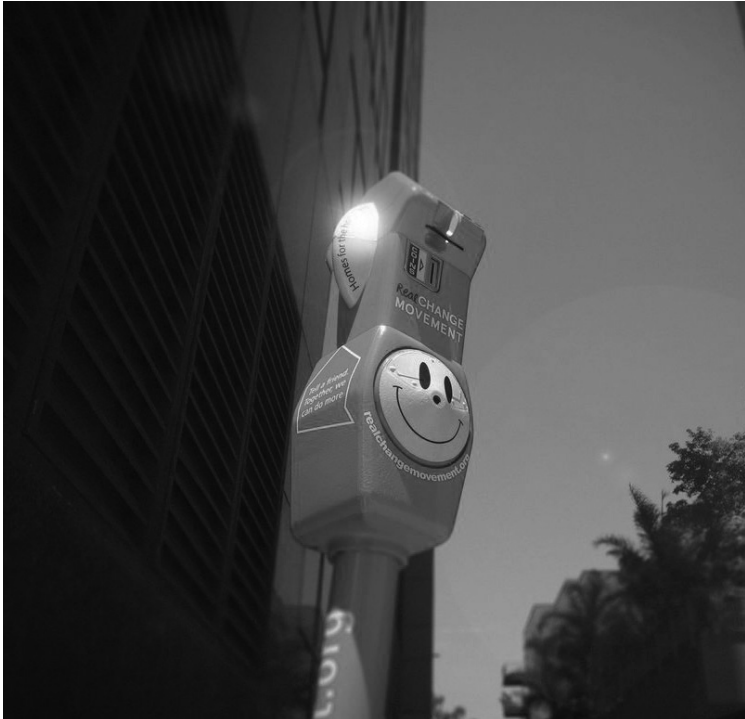
The meters will be brightly colored so that people don't mistake them for ordinary parking meters

The next time you visit The City of Angels, keep your eyes open for the brightly colored parking meters that are using coins to end homelessness. Add your support to the national project that raises valuable funds for the rough sleepers living in poverty in your area. Just think, change for the homeless in our country could start with the change in your pocket.