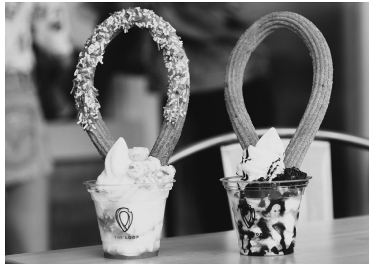
The Loop. Soft Served Ice Cream And Churro

they can also get creative with the drinks, and just like Snow Monster they have their own cups that you can take home with you. The drinks can also be customized with the different options they have, one unique memorable drink