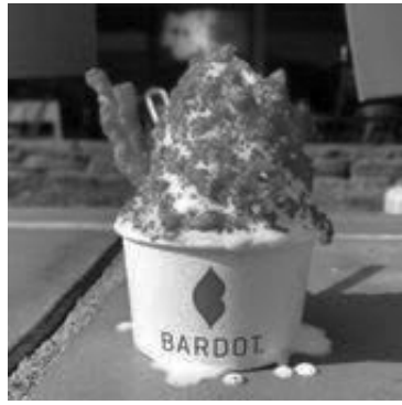
Bardot. Flaming Kiss

Next up is Atomic Creamery, which recently opened at Fashion Island this month! The creamery is a small mom-and-pop shop with a few modern touches ranging from liquid