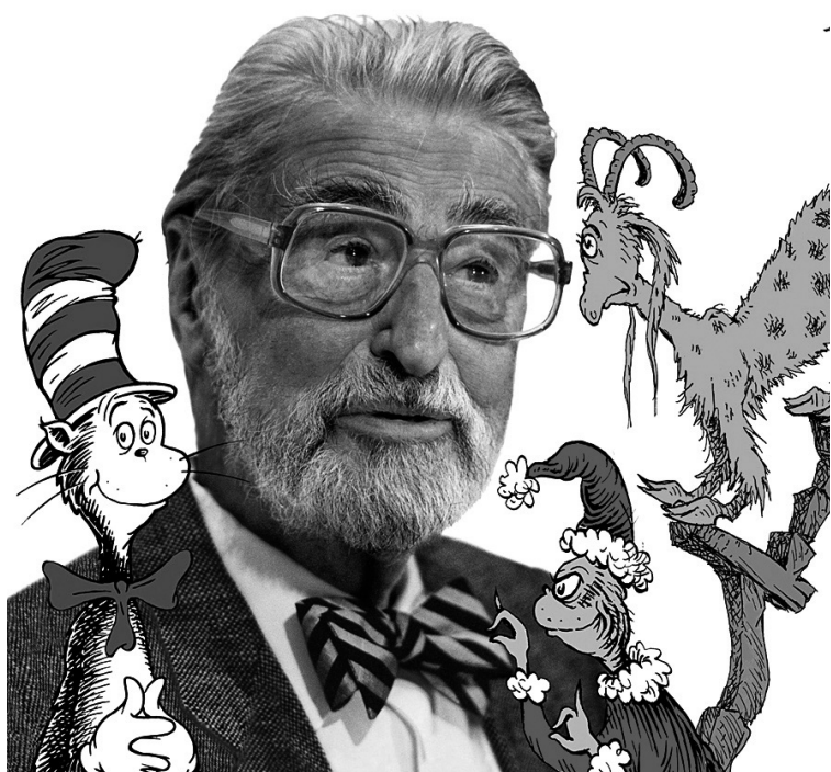
Dr. Seuss

He gave the youth of America profound and influential phrases such as, "The more that you read, the more things you will know. The more that you learn, the more places you'll go." The inspiration that Dr. Seuss has shared will prevail and last for generations to come.