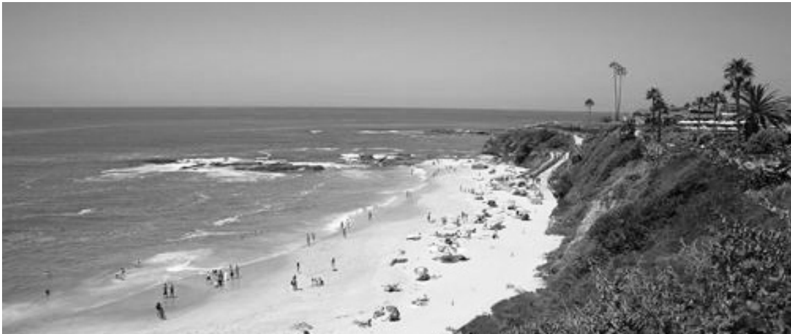
Laguna Beach is a great place to hang out with friends, read a book or even take a nap in the sun over spring break

Whether you're looking to spend your spring break exploring Newport and Laguna beaches, hiking, or supporting local artists, be sure to include some down time for yourself. Plan a