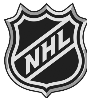
National Hockey League