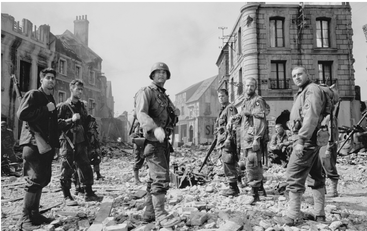
Tom Hanks, Matt Damon, Tom Sizemore, and Adam Goldberg in Saving Private Ryan (1998)

Seeing a movie like this, you can't help but think about how as a country, we don't always support our troops the way we should. Spielberg's directing, the cast's performances and the crews editing, help paint a pic-