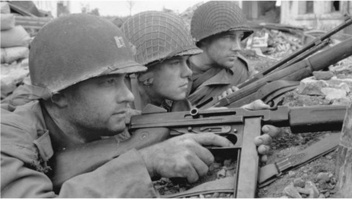
Tom Hanks, Matt Damon, and Edward Burns in Saving Private Ryan (1998)

Writing about war is hard, but "Saving Private Ryan" depicts the harsh realities of the situation and balances them with them levity and hope that feels real. Not many can do the subject justice, but Spielberg does a pretty good job. It's long movie, but if you have a minute (and by a minute I mean three hours) then I don't think you'll regret it.