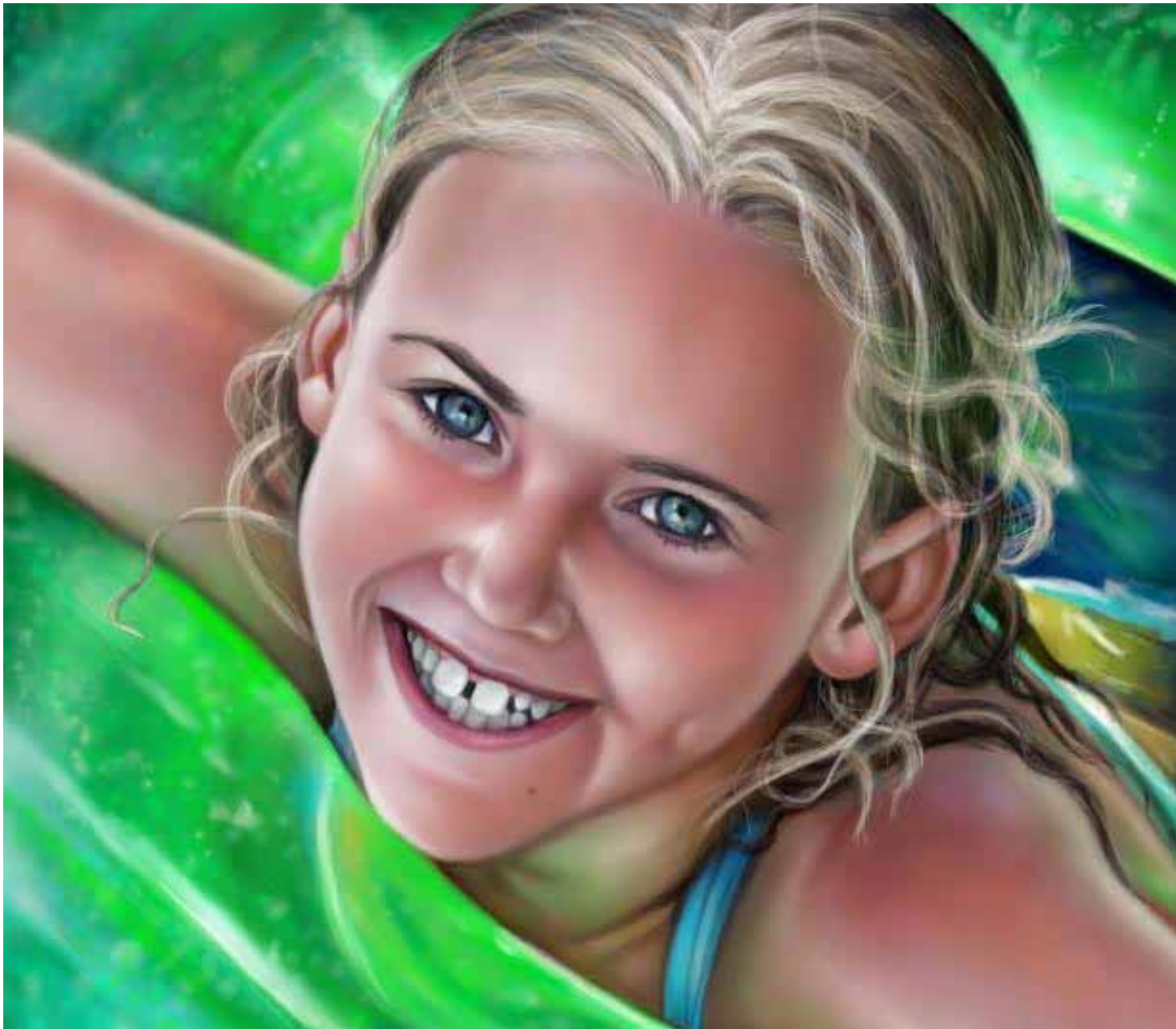
A digital painting from the exhibit entitled Jessica Joy Rees -- painted by Diana Mordin

"The Simplest Things" Art Exhibit runs in Grimm Hall from Sept. 9 – Oct. 7.