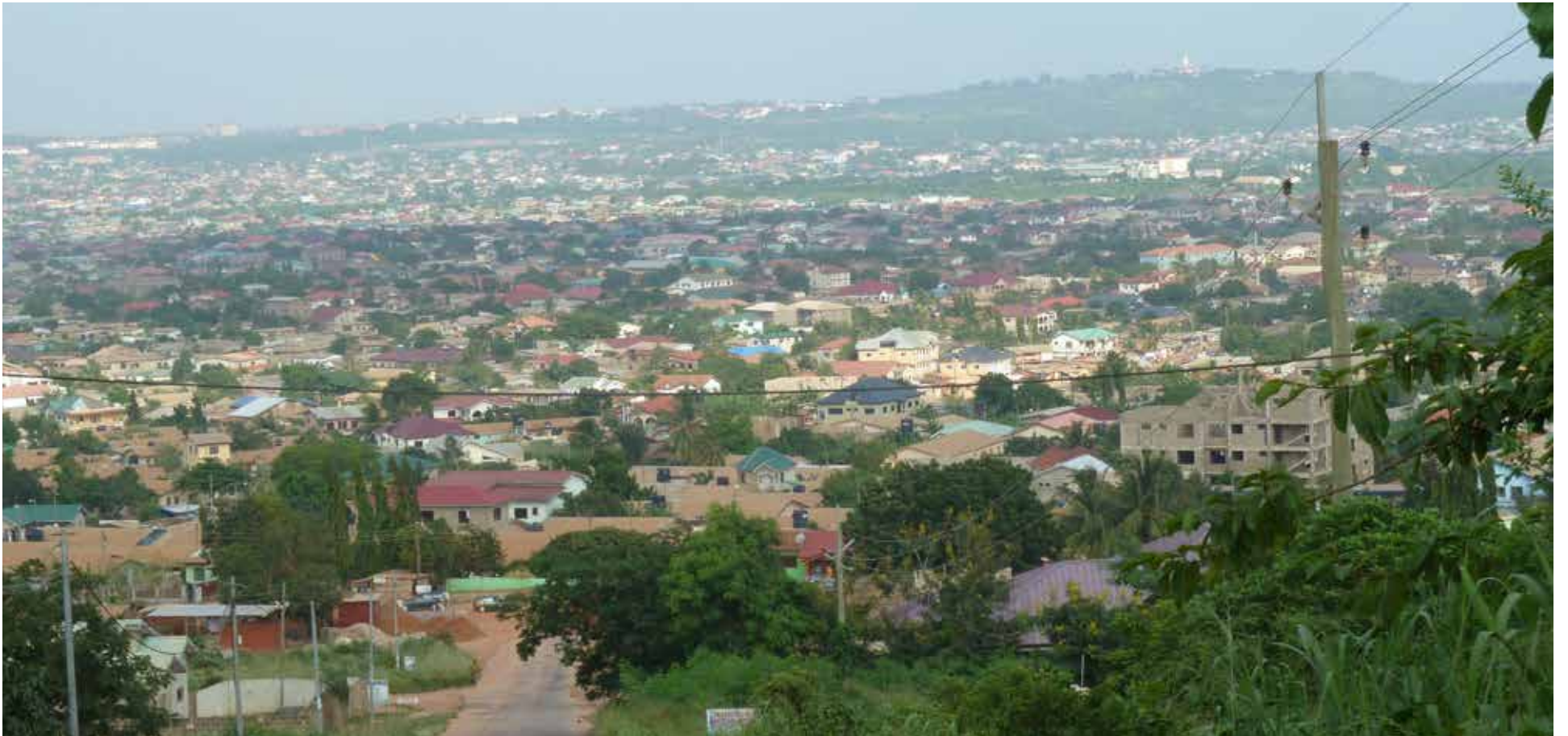
Accra, Ghana -- Photo Credit: ghanasunshine.com