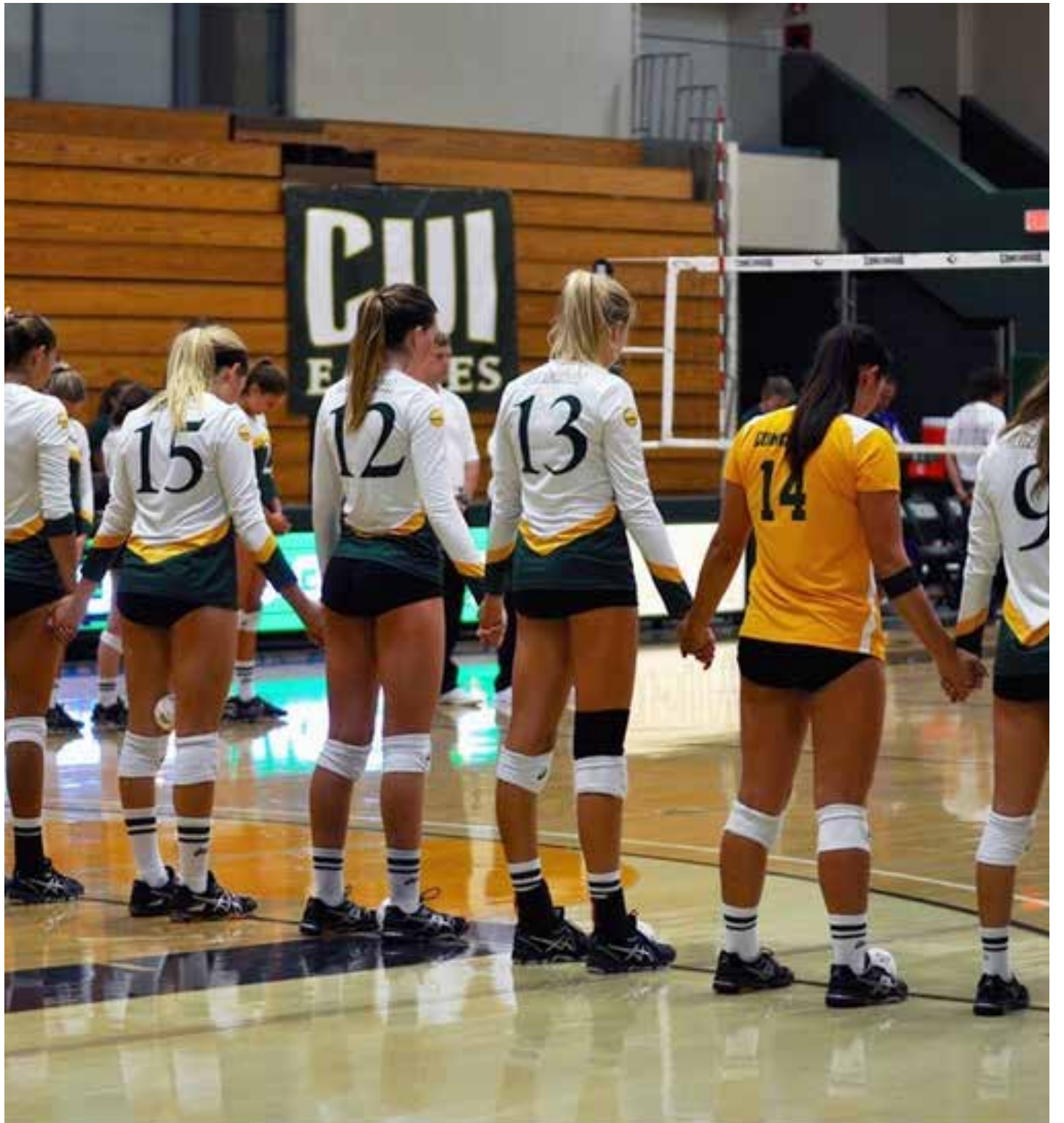
CUI 2015 Women's Volleyball Team

Now that Weishoff is back at Concordia, she is coaching the Women's Volleyball team as they prepare for their PacWest match. Weishoff believes that, "entering the Pac West match will show us, as a team, where we are and what changes/upgrades we need to make for the future." She is excited to enter the PacWest con-