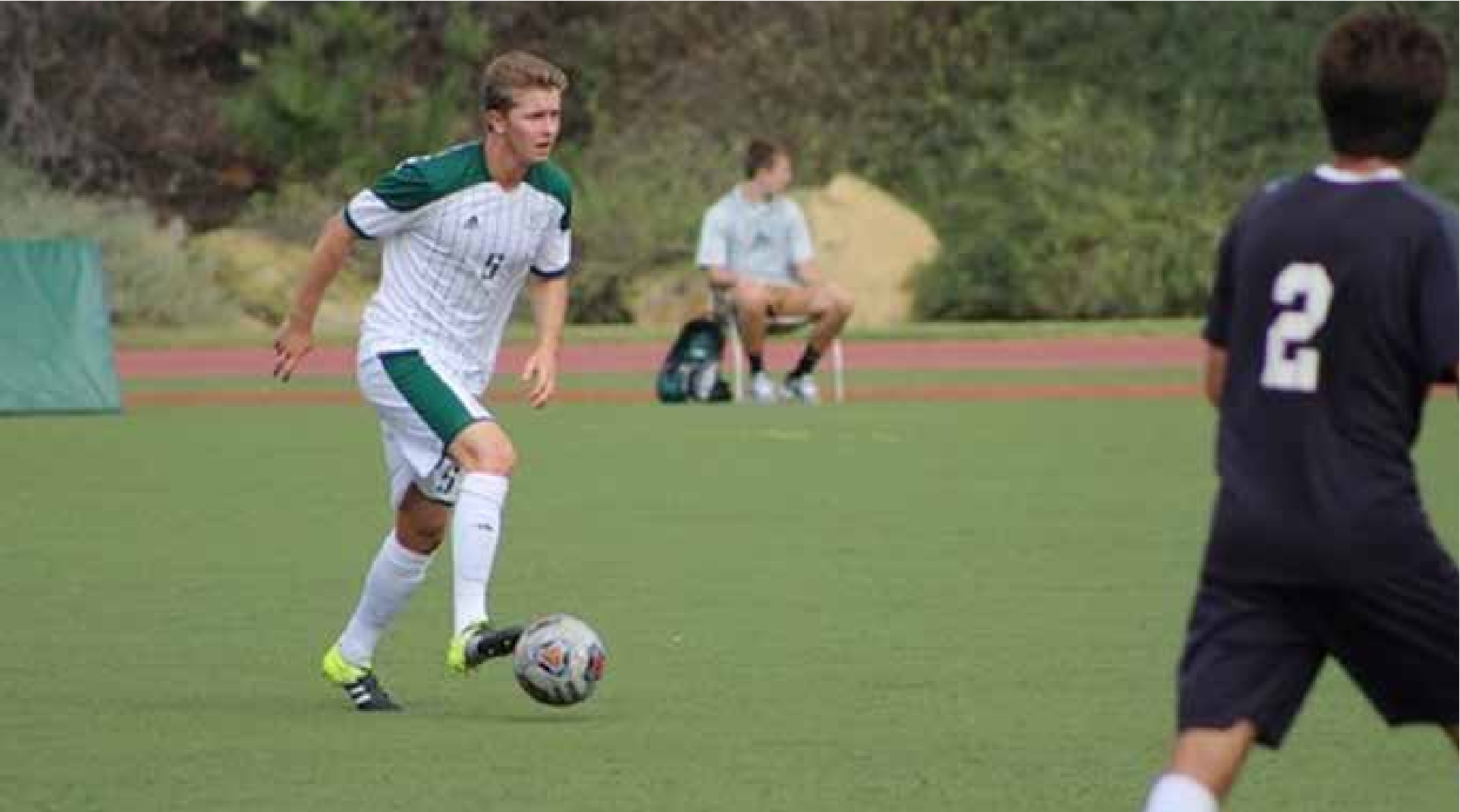
Men’s Soccer against Sonoma State