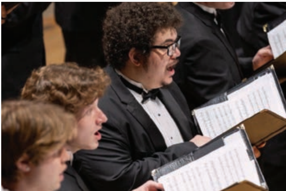
PICTURED ABOVE: Members of Men's Chorus, Donne Di Canto and Concordia Symphony Orchestra are eagerly anticipating their tour to Las Vegas.