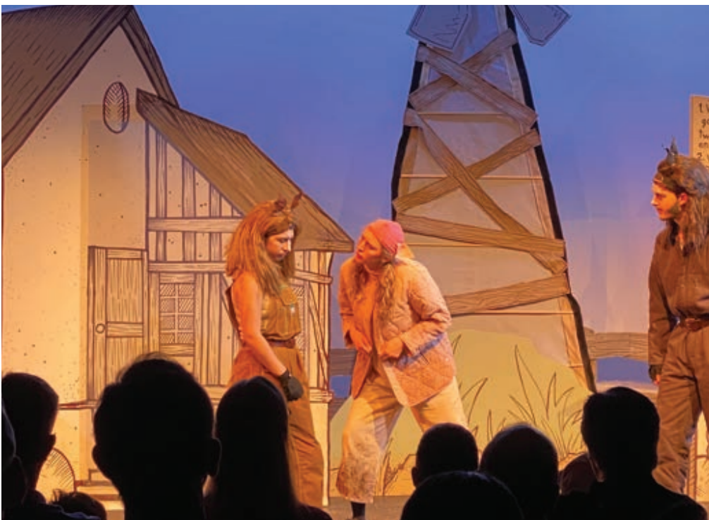
PICTURED ABOVE: The unique characters within the show required demanding physicality from the actors involved.