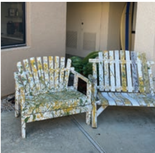
PICTURED ABOVE: Creative Edge Common Room