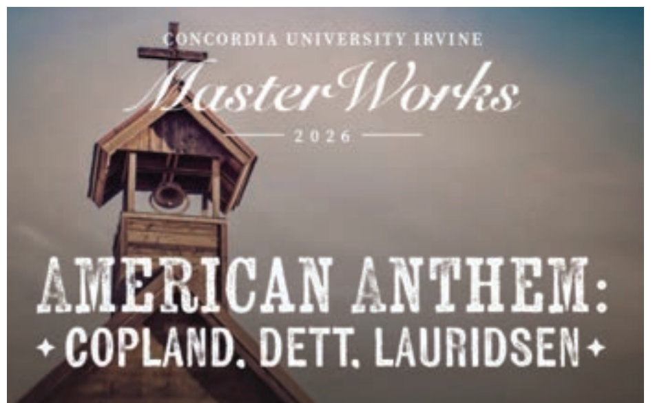
PICTURED ABOVE: Concordia's Music Department provides enriching and educational concerts, such as their upcoming "American Anthems."