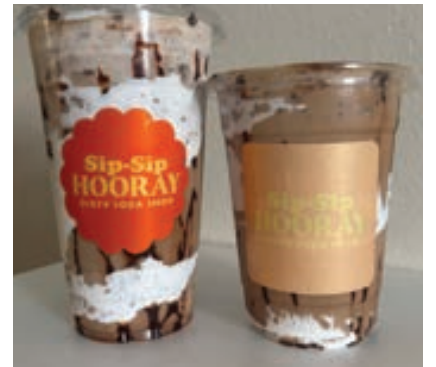
PICTURED ABOVE: Follow @sipsiphooraysoda on Instagram to place your order

Wanting to order your Sip-Sip Hooray? Orders are able to be made through Instagram DMs. Pick-up times for beverages are posted daily on the accounts’ Instagram stories. Follow @sipsiphooraysoda on Instagram for the latest updates and news on Concordia’s newest beverage business.