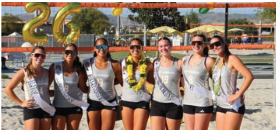
PICTURED ABOVE: The seven seniors before their ceremony