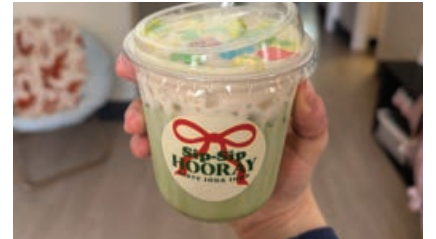
PICTURED ABOVE: The small business is run on campus, allowing for easy pick up