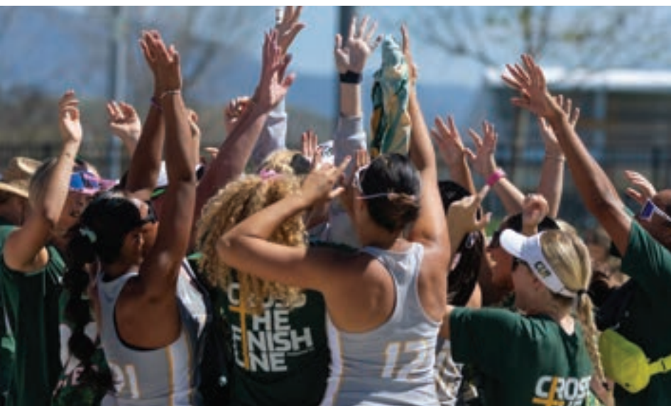
PICTURED ABOVE: Concordia Beach Volleyball team celebrates two consecutive wins