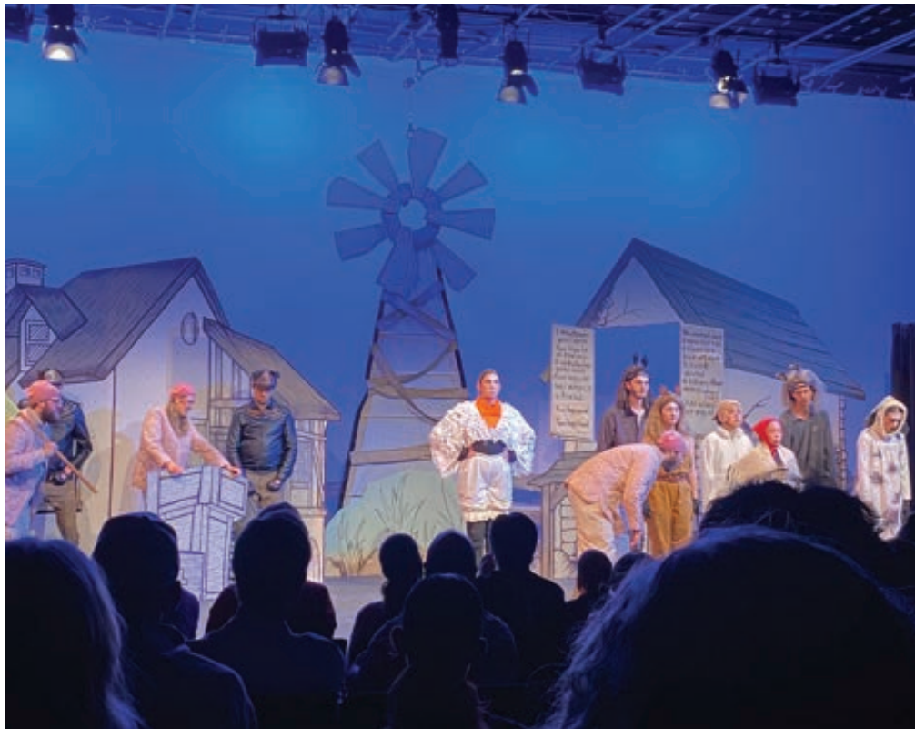
PICTURED ABOVE: The Theatre Department brought George Orwell's classic novel to the stage.