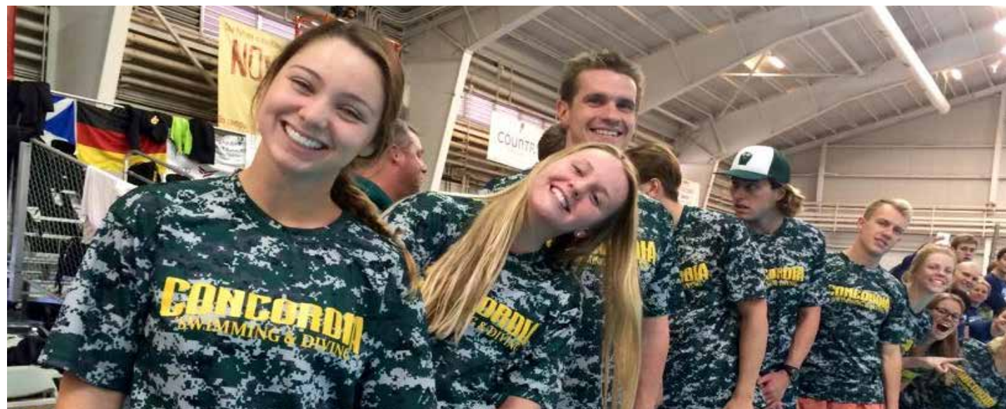
The Men's and Women's Swimming and Diving Team at the NAIA Swimming and Diving Nationals in Oklahoma City

Catch the returning members of the Men's and Women's Swimming and Diving Team next season as the program prepares to move into the competitive NCAA Division II, which all athletic programs at Concordia are preparing to transition into. For more information on our swimming and diving team, visit cuieagles.com .