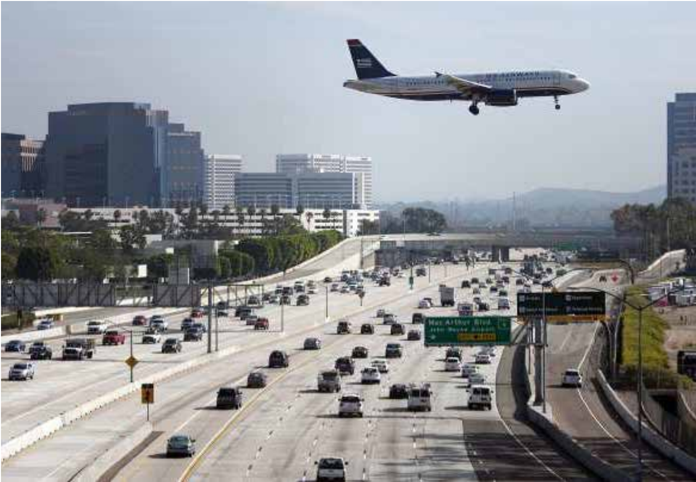
Exhibit at John Wayne Airport displays OC universities' art