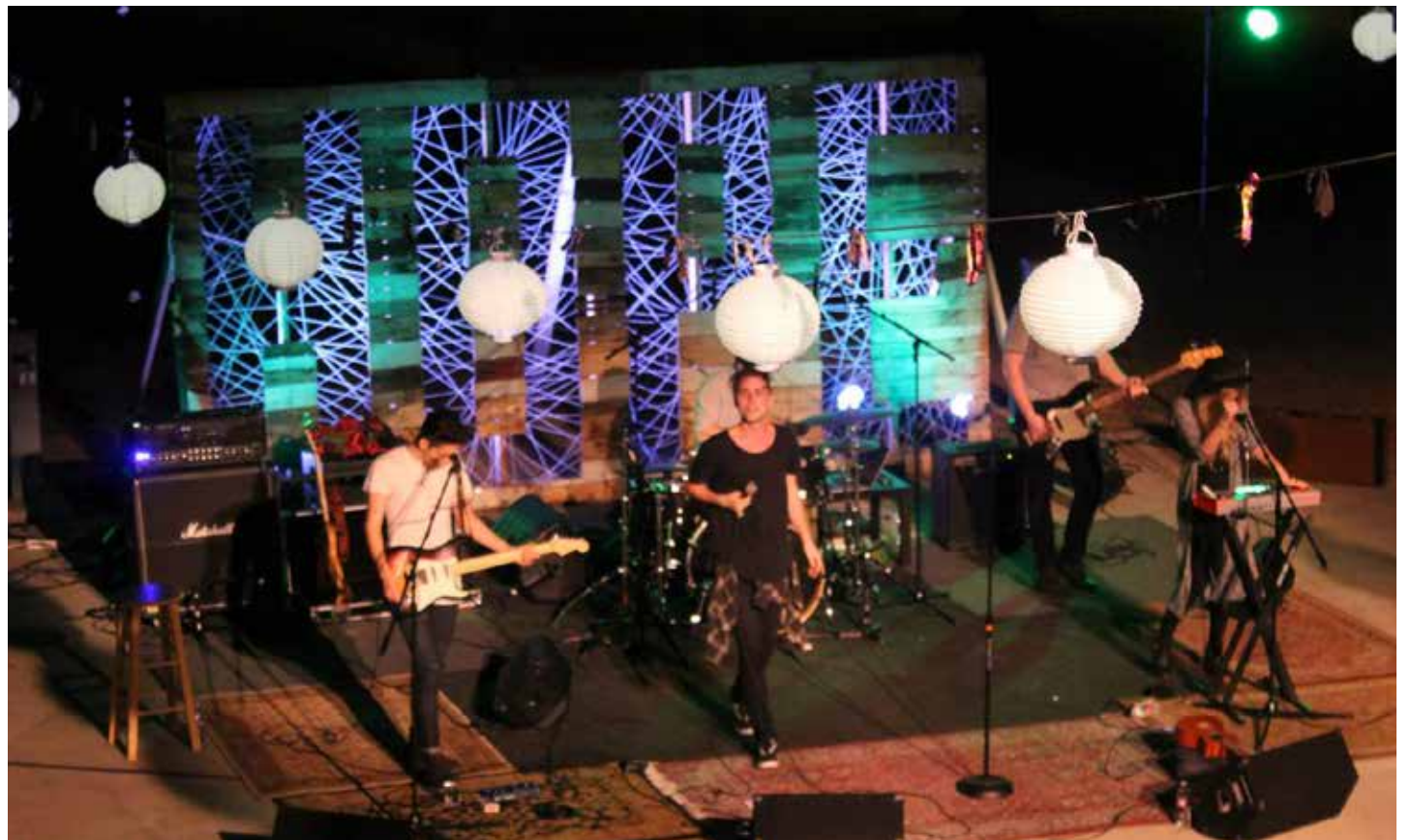
City of Lions rocks out at Night of Hope

To volunteer for the next Night of Hope, email nightofhope@cu.edu . Be sure to visit Night of Hope's official Facebook page for photos from the event. To learn more about Heavenly Treasures and its volunteer opportunities, visit heavenlytreasures.org .