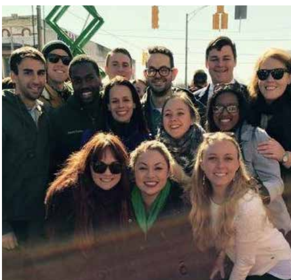
CUI students and faculty at the 50th anniversary March on Selma