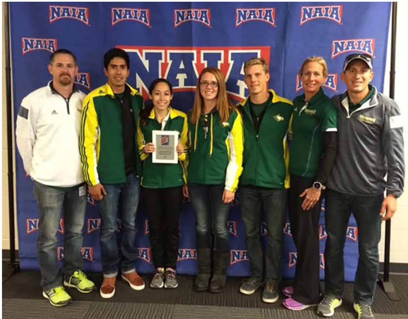
CUI Track and Field Team at the NAIA Indoor Track and Field Nationals in Geneva, Ohio

Keep track of the Track and Field team's accomplishments as they enter the Outdoor season by checking out cuieagles.com .