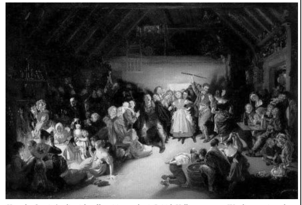
How the Courier's editorial staff envisions a classic British Halloween party. We also question what it means to be a "big girl's blouse."

And that's about all the time we have for today's class. Remember, you don't need to publicly humiliate yourselves in an attempt to prove yourselves; just accept you're already a big girl's blouse.