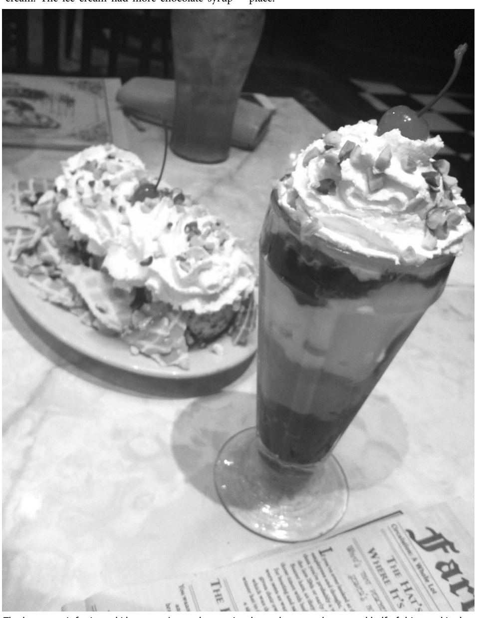
The legen- wait for it, and I hope you're not lactose intolerant because the second half of this word is-dary ice cream of Ferrell's.

It took the four of us about two and a half minutes to lick the bowls clean. Overall, our experience was fairly good. We were served quickly and, once seated, the entire outing took less than 20 minutes. Our server was friendly, and the ice cream was tasty. I would recommend that you check out this place at least once, but you might want to call ahead to make sure no "special" events are taking place.