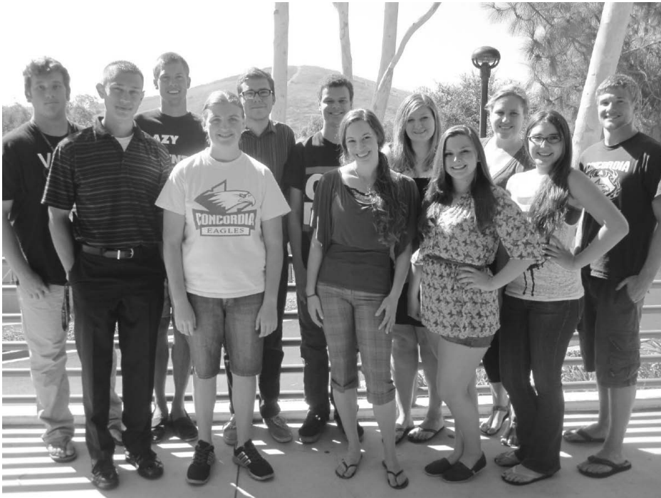
2012-13 student senators look forward to serving the school.

If you wish to see what Senate is all about, you are welcome to attend any open forum meeting on Wednesdays at 10:30 a.m. in Student Union 202.