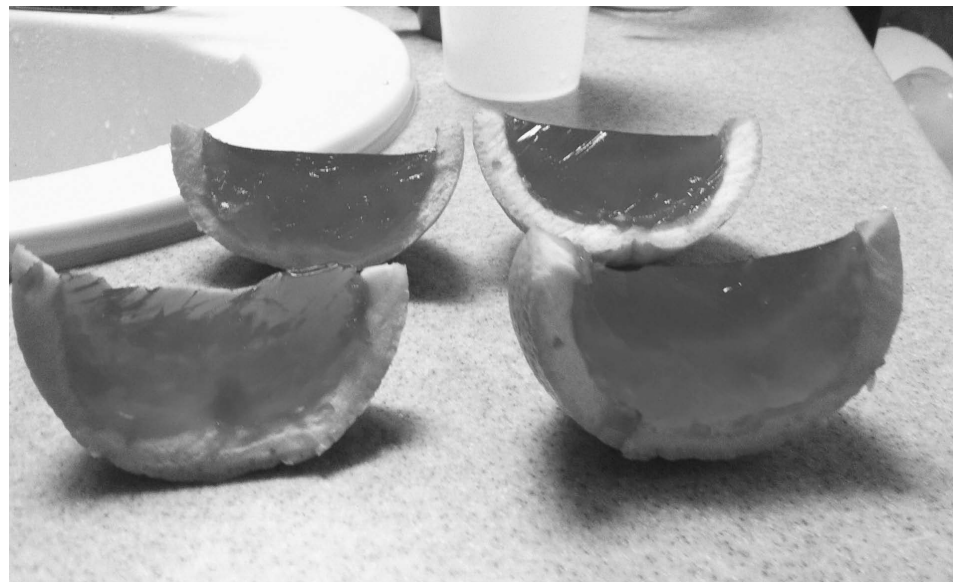
Results from Day 1 of the Pinterest project