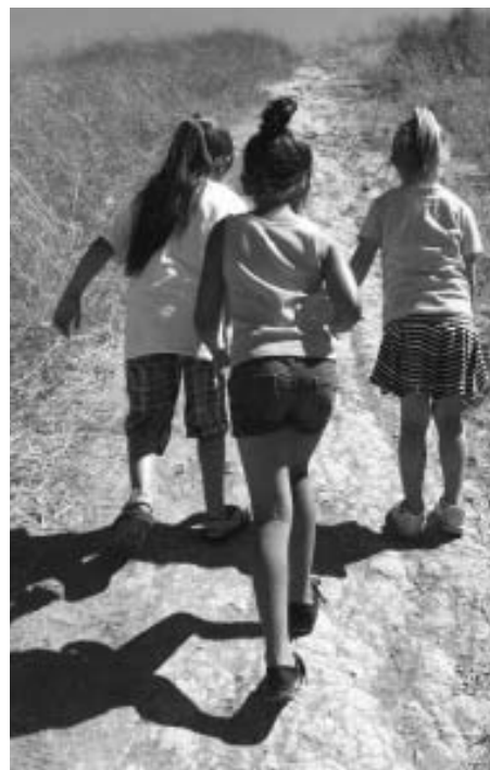
Village of Hope summer program participants march up French Hill.

This past summer, Concordia staff and students held a four week, half-day learning camp for school-age children from the Village of Hope (VOH). This camp was put in place in order to provide the kids with hands-on learning activities in a variety of different subjects. The VOH is a transi-