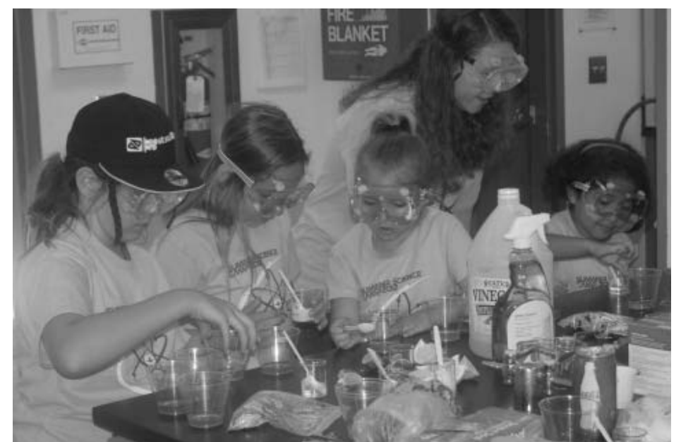
Little scientists conducting experiments in Concordia's lab.