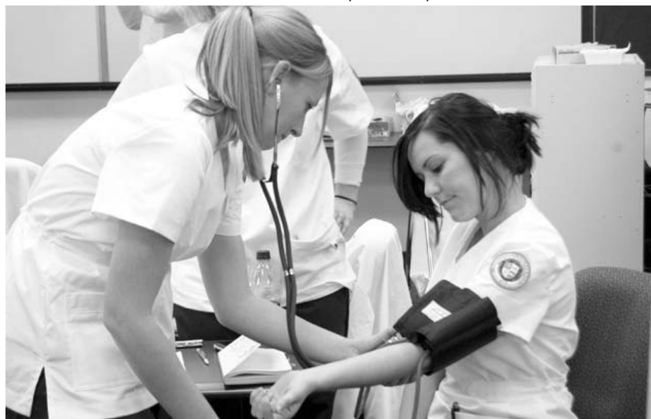
Nursing students practice skills for real world jobs.