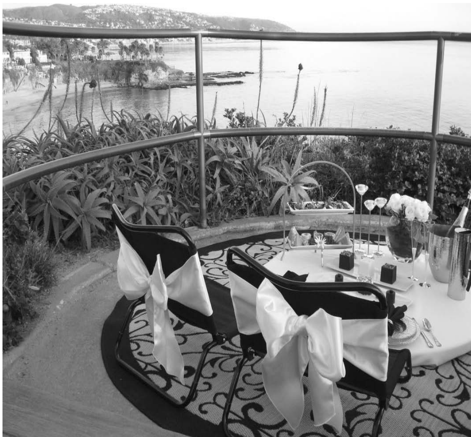
A sample photo from the Laguna Beach picnic package.

For more information, or to get a consultation for a possible future romantic evening, you can contact Shapiro at her website, SeasideRomance.com, or email the company at makingmemories@seasideromance.net.