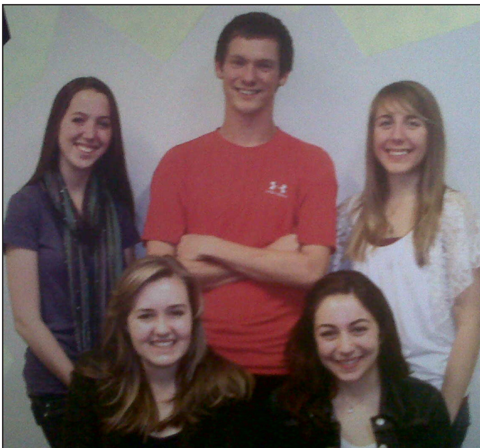
The five PACs for the 2012-2013 school year plan for success.