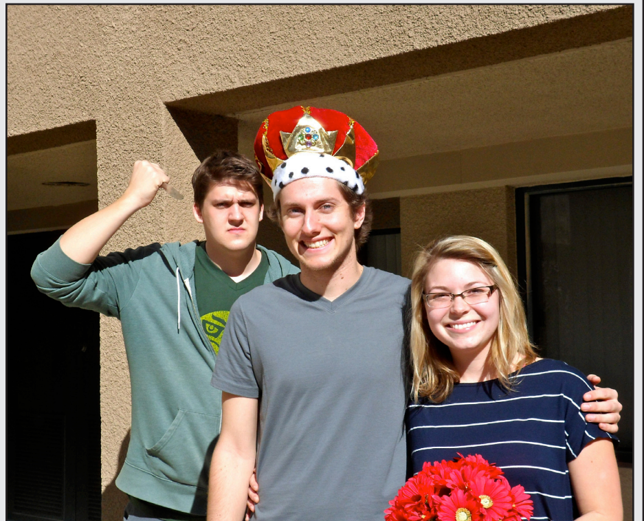
Dak finished behind Kolmer after being nominated for Homecoming King.