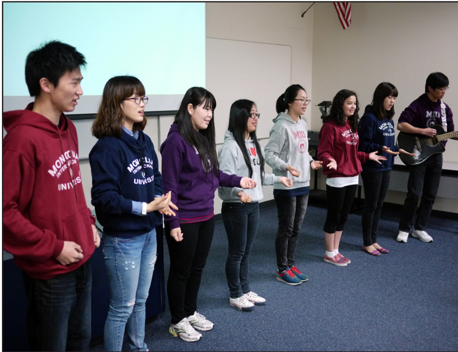
A group of ten students and professors from Mongolia International University visited Concordia from Jan. 30-Feb. 2