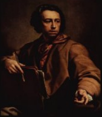
Johann Wolfgang von Goethe