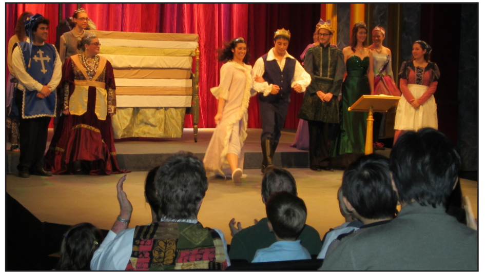
Actors perform on Sat. Feb. 4.

The set was very simple, containing a deep red curtain upstage and gold pillars on either side of the stage, but the actors brought the set to life with their electrifying portrayal of the characters. It was also really fun to see a contrast of the old-looking costumes with the modern comedic devices. The play was well received with nearly all shows having a full-house.