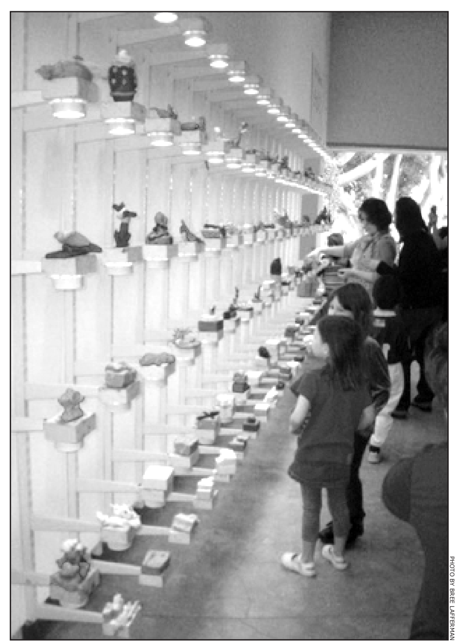
until Sept. 19. For more information visit OCMA's Art appreciators of all ages enjoy the Orange County Museum of Art's interactive clay exhibit.

Both "Charles Long: 100 Pounds of Clay," and "15 Minutes of Fame: Portraits from Ansel Adams to Andy Warhol" will be at the Orange County Museum of Art until Sept. 19. For more information visit OCMA's website at www.ocma.net.