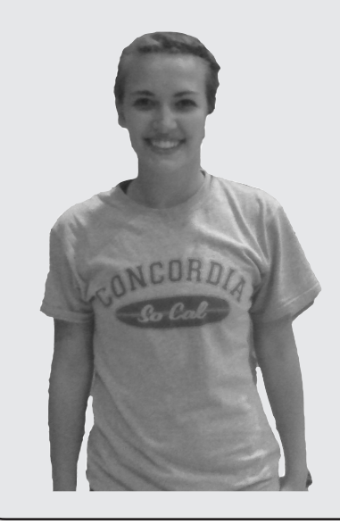
" Coming from rain, Oregon, the weather along with the beautiful campus made a great first impression. Also, there was so much to do and get involved with."