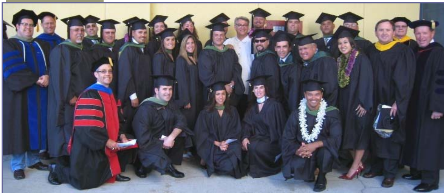
The MCAA Class of 2009 with Graduation Speaker Dave Dravecky